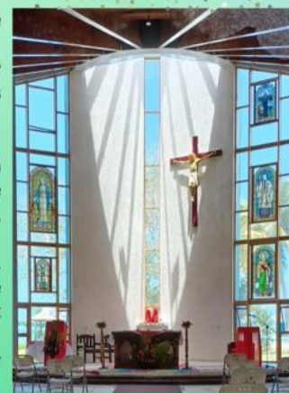
Our Lady of the Assumption church, Lamary, Fiji

Each Gospel tells miracle stories. Some of these stories are the same but with fascinatingly different details. Some other miracles are particular to one Gospel.