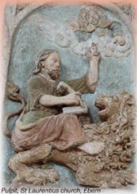
Pulpit, St Laurentius church, Ebern