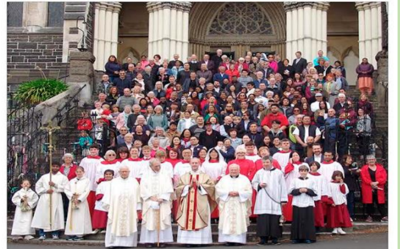
Sanctuary changes in Dunedin cathedral - pg 5

Six times judged Australasia's leading Catholic newspaper