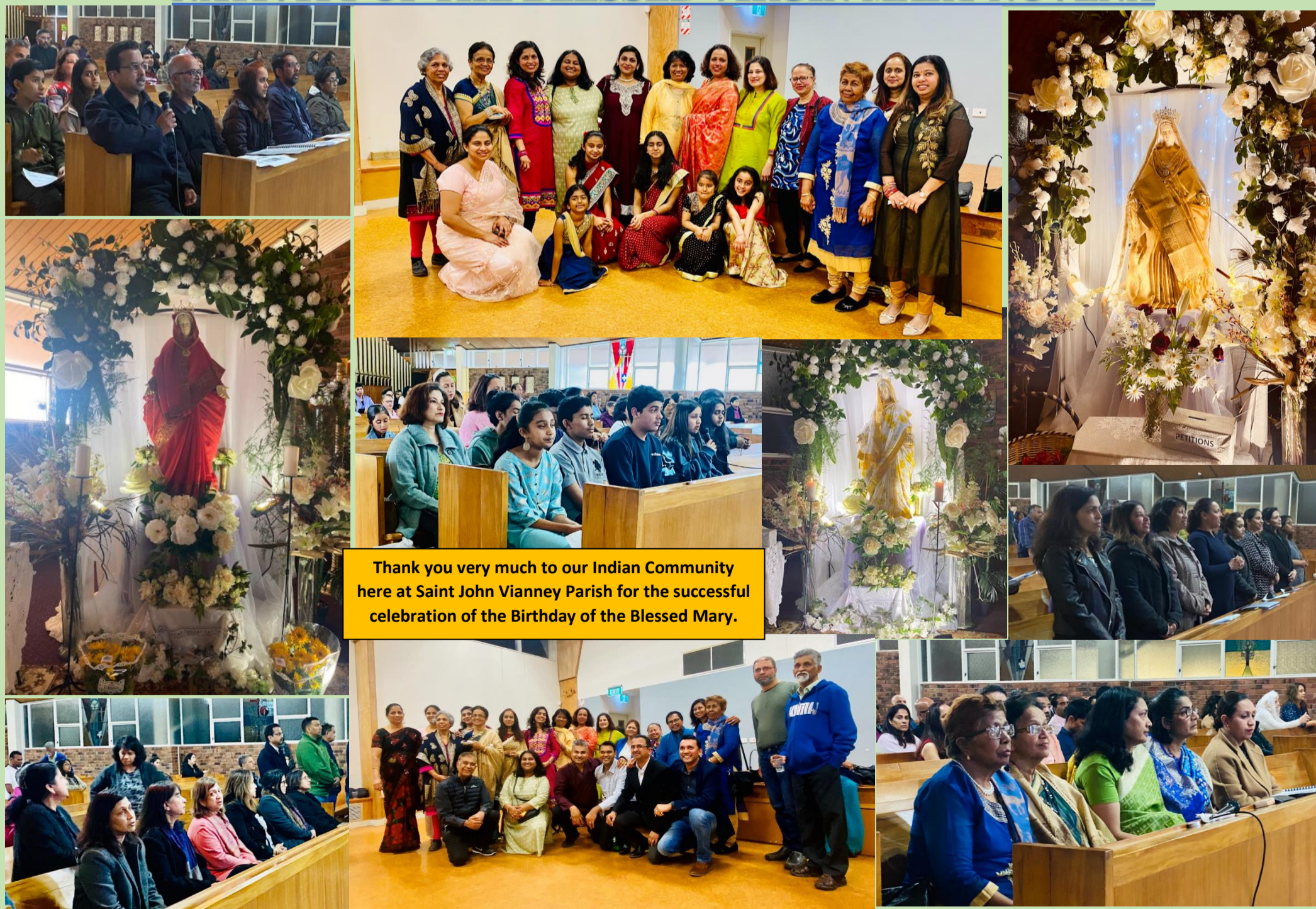
Thank you very much to our Indian Community here at Saint John Vianney Parish for the successful celebration of the Birthday of the Blessed Mary.