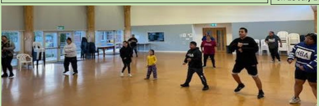
Parish Zumba every Saturday at 7:30 am. Join Us!

https://www.aucklandcatholic.org.nz/staff-vacancies/ Applications close on 23 July 2024.